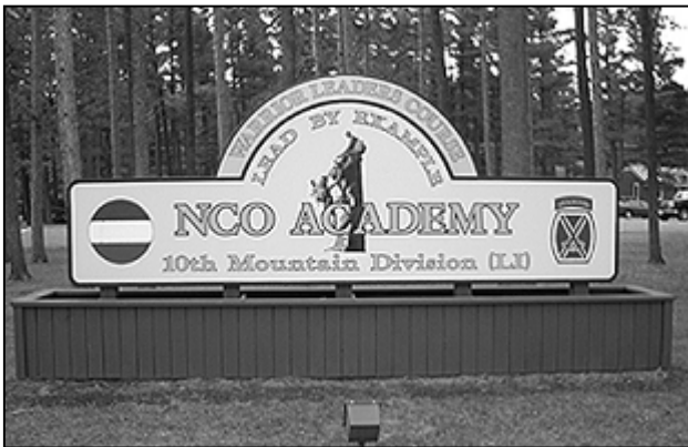
10th Mountain Division

Among other things, The EPMS plan was to tie NCOES to pay grades and promotions. Its impact on NCOES was long range and far reaching, phased to be accomplished by 1977. Pilot courses of the PNCOC were held in the summer of 1975 at Forts Carson and Campbell. The transition from NCO academy leadership courses to PNCOC, and later PLC, took well into 1978. A separate group of courses was developed in 1976 for the combat support and combat service support NCOs that were technical in nature. The PLC for CS/CSS were mainly leadership oriented and for the