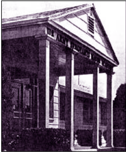
Sergeants Major Academy