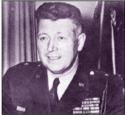
Brig. Gen. Bruce C. Clarke

designed to prepare selected career-enlisted personnel for progressive levels of duty, and noted it would enhance career attractiveness and the quality of the noncommissioned officer. This study recognized that "The present haphazard system of career development, as opposed to skill development, had two bad results. First, the image of the NCO as a professional, highly trained individual is difficult to foster; second, the Army's resource of intelligent enlisted men, anxious to develop as career soldiers, is inefficiently managed. The Army has extended great effort to ensure the selected development of its officers. Analagous [sic] effort should be spent in the development of the noncommissioned officers of the Army."