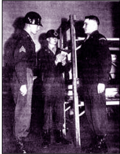
Inspection Time, Blue Devil style

attrition rapidly thinned the ranks of these trained noncoms. Hastily devised training programs produced more NCOs primarily trained to fight rather than lead soldiers in a garrison. New inductees would receive hands-on instruction for their basic combat training, then were sent to their unit for additional training. A man was promoted if he showed potential, with privates becoming corporals, and corporals, sergeants. These NCOs were not as capable as their pre-war predecessors, and the experience level of the noncommissioned officer continued to decrease.