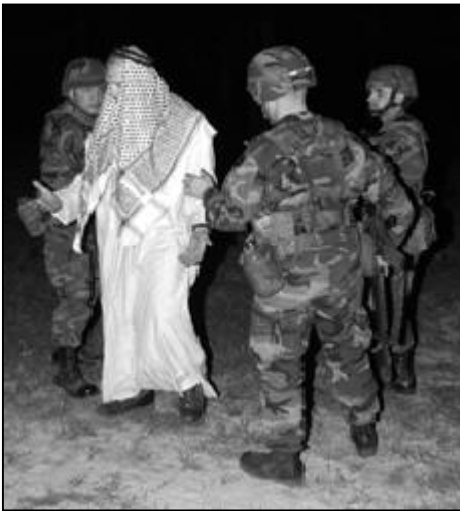
Students at Ft Dix NCOA

The approved “Vision” for the future NCO has established a path for perpetual learning for the noncommissioned officer corps to bring it solidly into the twenty-first century. Training has been a part of our Army