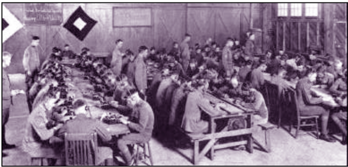
Signal School, circa 1920

In 1868, the Signal Corps established a signal school of instruction which was opened at Fort Greble and, in 1869, moved to Fort Whipple (later Fort Myer). By 1871 the Signal School at Whipple had a primary duty to train observer-sergeants and assistant observers in their duties. Candidates were selected from the enlisted men of the signal detachment and were designated as assistant observers. They were taught subjects on military signaling, telegraphy, and meteorology and pursued a regular course of study. The candidate was promoted to observer-sergeant after completing their studies,