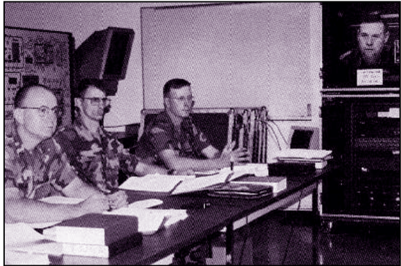
49th AD ANCOC via distance learning

sergeants major course for sergeants major.