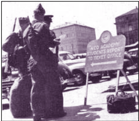
Reporting in at the Constabulary NCO Academy