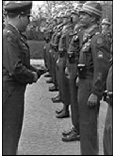
Trooping the line at the Constabulary School

covering force in the event of renewed hostilities. In January 1946 the Third U.S. Army Commander, Lt. Gen. Lucian Truscott, gave the task of organizing this force to Maj. Gen. Ernest Harmon. Harmon was given until July to have this force readied to carry out its assigned tasks and would be headquartered in Bamberg. Early in the planning stages the need for a Constabulary school became evident. The Constabulary trooper needed to not only know the customary duties of a soldier, but police methods, how to make arrests, and how to deal with the local population.