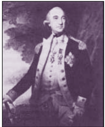
Baron von Steuben

One of the earliest mentions of educating noncommissioned officers outside the unit was during the early days of the Continental Army. When Prussian officer Friedrich von Steuben arrived at Valley Forge he recognized many problems, particularly in discipline, supply, and training. As he set out to restore discipline, Steuben developed tactics using a simple form of manual of arms. In March 1778 General George Washington ordered an additional 100 men to the Commander in Chief's Guard to serve as participants