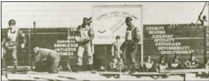
Seventh Army NCO Academy