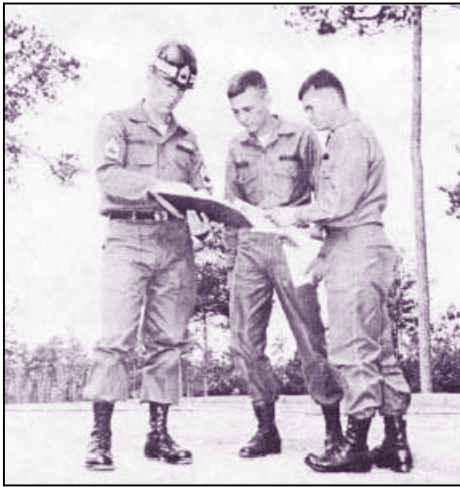
A TAC NCO critiques candidates

over, and demonstrated leadership potential. Based on recommendations, the unit commander would select potential NCOs, but all were not volunteers. Those selected to attend NCOCC were immediately made corporals and later