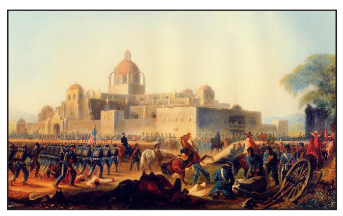
The Assault on Churubusco

In March 1847, the Americans made an amphibious landing at Veracruz, Mexico and headed for Mexico City. This bold move sought to crush Mexican resistance by taking their capital. The road to Mexico City proved indeed to be a bloody one.