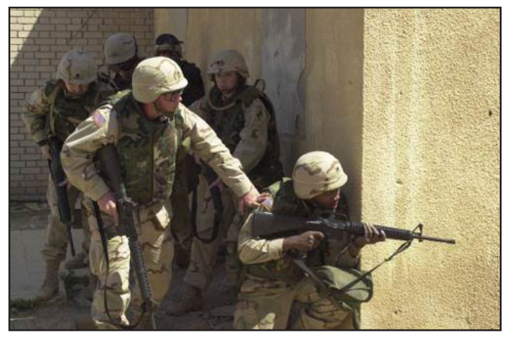
Searching the Streets in Iraq