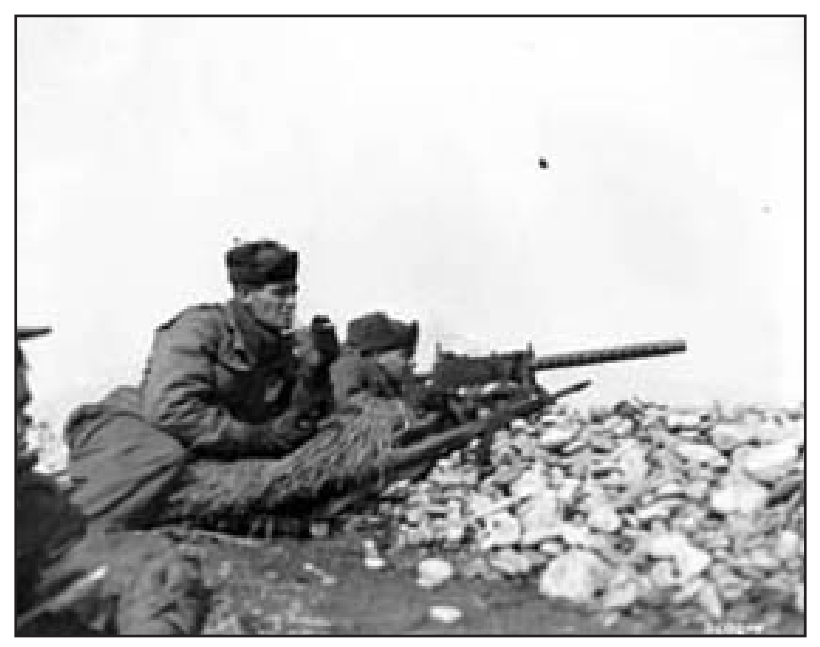
Company K, 35th RTC, 25th Division

In 1950, an ill-prepared United States found it needed to commit large numbers of troops to a nation a half a world away. The North Korean attack on South Korea, America's ally, stressed American responsibilities overseas in the post-World War II era. It became clear from this point forward that American commitments in Asia, Europe, and the Pacific required a strong and combat-ready professional Army.