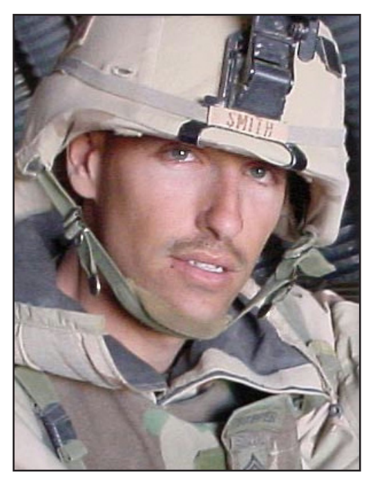
SFC Paul Ray Smith

After fighting for three consecutive days, Smith and his men pushed forward to Baghdad on the night of 3 April. They reached an area to be used as a blocking position between the airport and Baghdad at 0600 on 4 April. The road to the airport, Highway 8, consisted of a four-lane highway with a median. On each side of the highway were large masonry walls with towers about 100 meters apart. Early in the morning on 4 April, the Platoon Leader went on a reconnaissance mission with the B Company, Task Force 2-7 Commander, leaving Smith in charge of the troops. (*Medal of Honor) Firing could be heard to the south; however, around the 2<sup>nd</sup> Platoon's area, all was quiet.