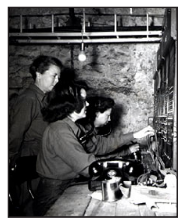
Enlisted women of the Signal Corps

In 1945, Congress passed legislation entitling enlisted men with at least 20, and not more than 29 years of service, to retire. They thereupon drew 2\frac{1}{2} percent of their average pay for the six moths preceding retirement, multiplied by the numbers of years of active service. These men remained in the reserve until completion of 30 years of service. (*Fisher)