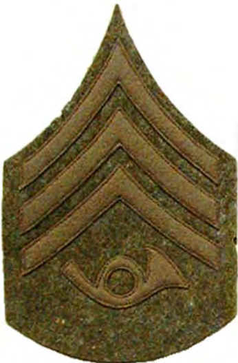
14. SERGEANT BUGLER.