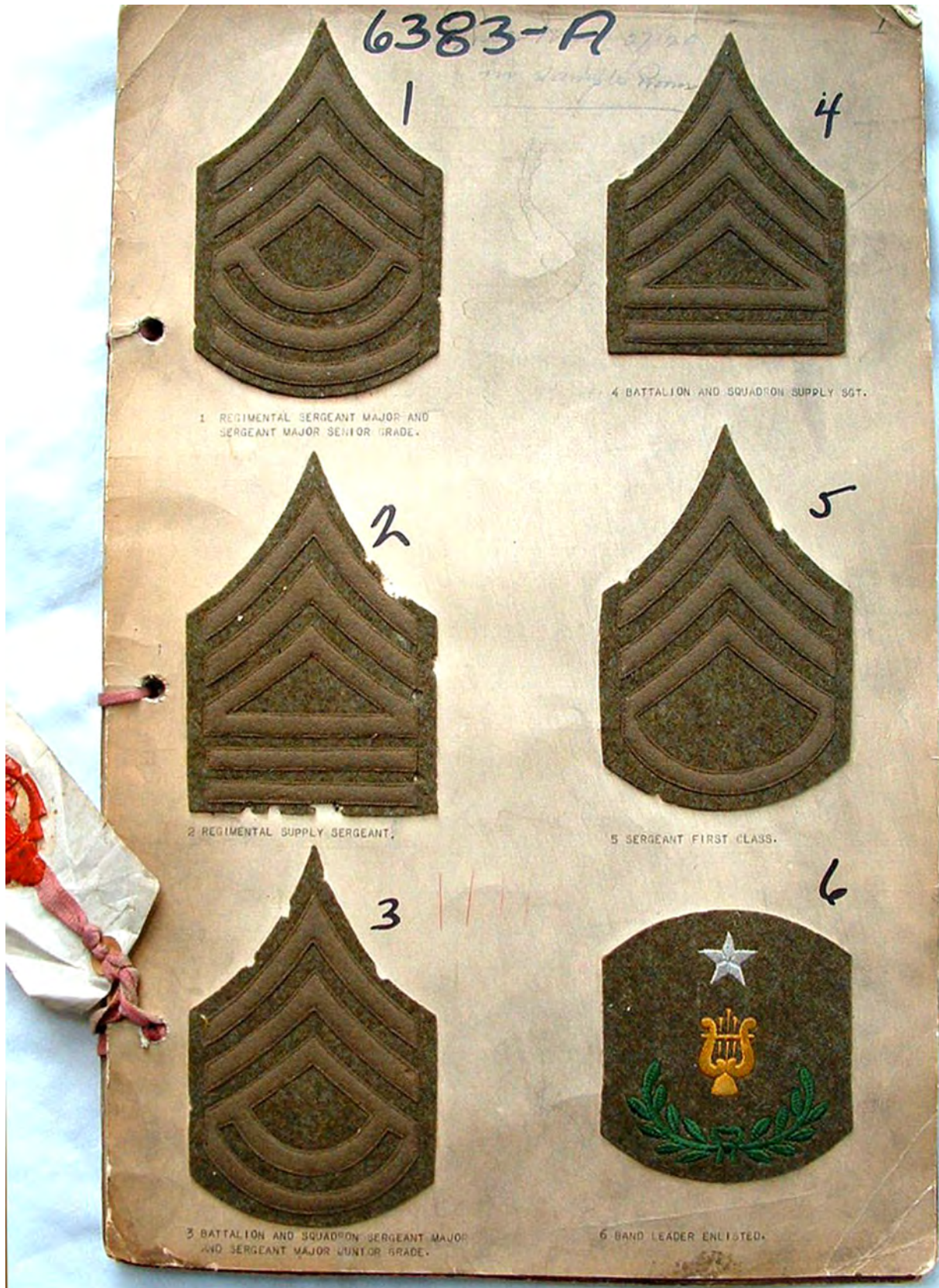
FIG 3A. Page one of the sample book. Because of the reduction in size and condition of the mounting cardboard, this page is repeated opposite, with the chevron images extracted from the pages, while keeping them in the same order as they appear on the page, with readable labels applied. Pages 2 through 10 follow in the same reconstructed format.