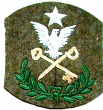
57. QUARTERMASTER SERGEANT SENIOR GRADE QUARTERMASTER CORPS.