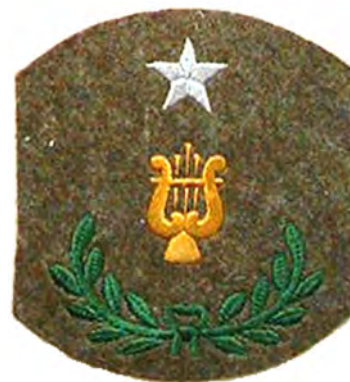
6. BAND LEADER ENLISTED.