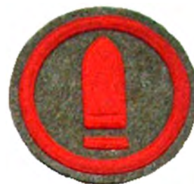
72. EXPERT GUNNER C.A.C.