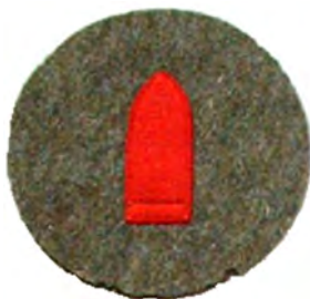
68. SECOND CLASS GUNNER FIELD ARTILLERY AND GUN AND MOTOR CO. C.A.C.