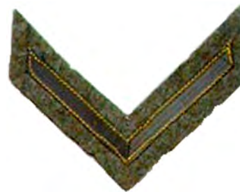
73. WOUND AND WAR SERVICE.