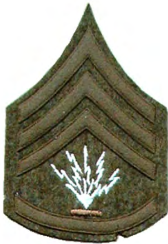
37. ELECTRICIAN SERGEANT FIRST CLASS C.A.C.