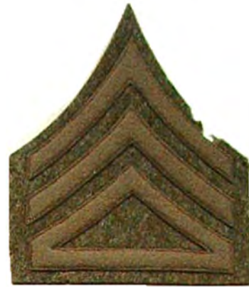
10. SUPPLY SERGEANT.