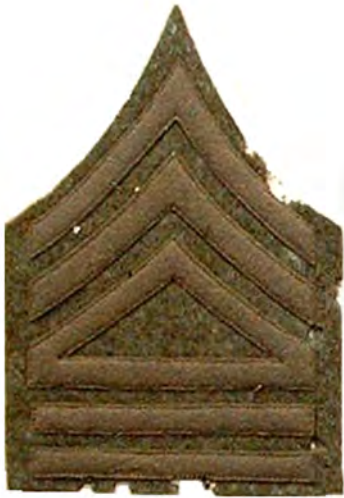
2. REGIMENTAL SUPPLY SERGEANT.