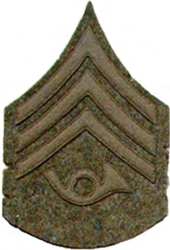
60. SERGEANT OF FIELD MUSIC.