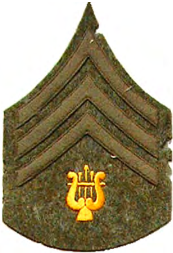
13. BAND SERGEANT.