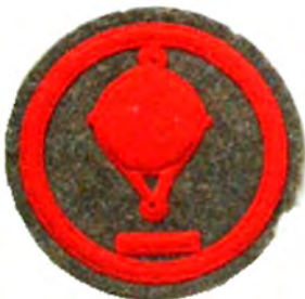
47. CHIEF PLANTER C.A.C.