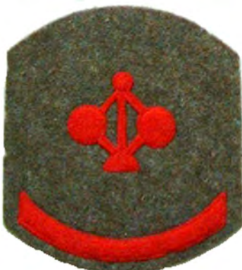
39. FIREMAN C.A.C. FIREMAN MINE PLANTER SERVICE.