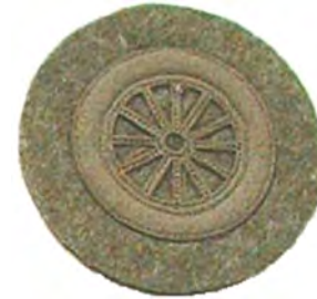
24. ASSISTANT CHAUFFEUR.