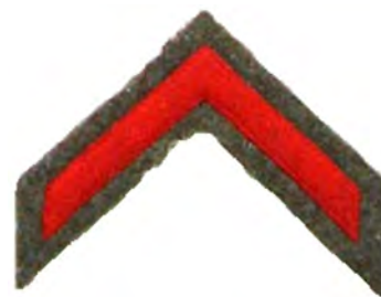
76. DISCHARGE CHEVRON.