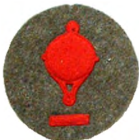
69. FIRST CLASS GUNNER MINE CO. C.A.C.