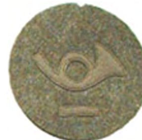
25. BUGLER FIRST CLASS.