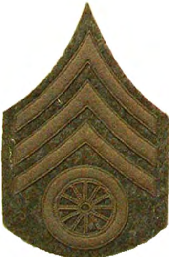
15. MOTOR SERGEANT.