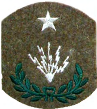
62. MASTER SIGNAL ELECTRICIAN AIR SERVICE.