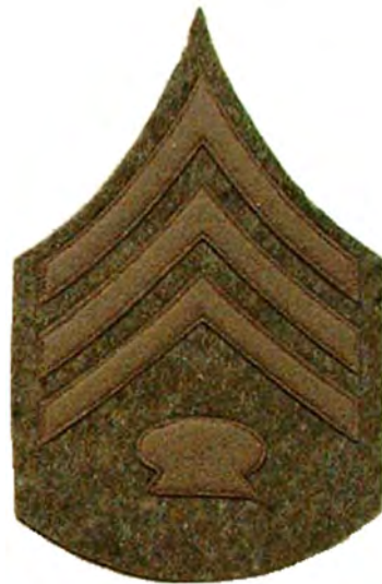
11. MESS SERGEANT.