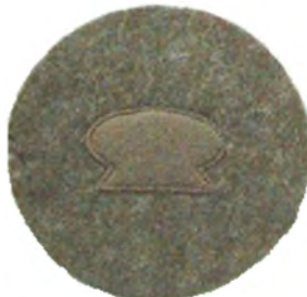
31. COOK ALL ARMS OF SERVICE INCLUDING MINE PLANTER SERVICE.