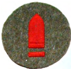
67. FIRST CLASS GUNNER FIELD ARTILLERY AND GUN AND MOTOR CO. C.A.C.