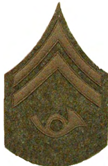
18. CORPORAL BUGLER.