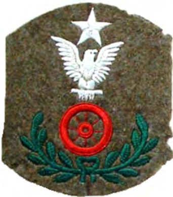
61. MASTER ENGINEER SENIOR GRADE TANKS CORPS.