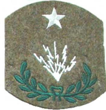
34. MASTER ELECTRICIAN C.A.C.