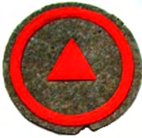
44. OBSERVER SECOND CLASS C.A.C.