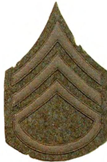
5. SERGEANT FIRST CLASS.