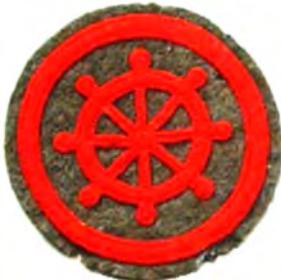
46. COXSWAIN C.A.C.