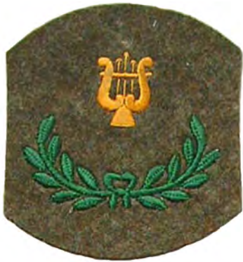
7. ASSISTANT BAND LEADER.