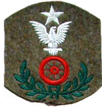
63. MASTER ENGINEER SENIOR GRADE TRANSPORTATION CORPS.