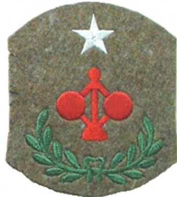
35. ENGINEER C.A.C.