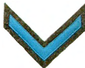
74. WAR SERVICE.