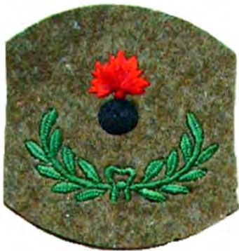
53. ORDNANCE SERGEANT.