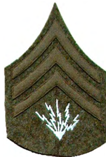
40. RADIO SERGEANT C.A.C.