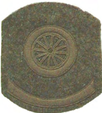
22. CHAUFFEUR FIRST CLASS.