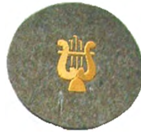
33. MUSICIAN FIRST, SECOND, AND THIRD CLASS.