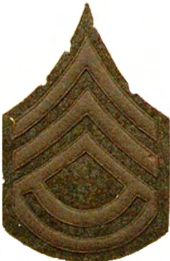
3. BATTALION AND SQUADRON SERGEANT MAJOR AND SERGEANT MAJOR JUNIOR GRADE.