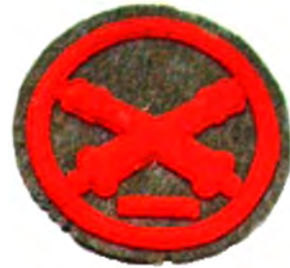
49. GUN COMMANDER C.A.C.