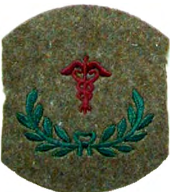
56. HOSPITAL SERGEANT.