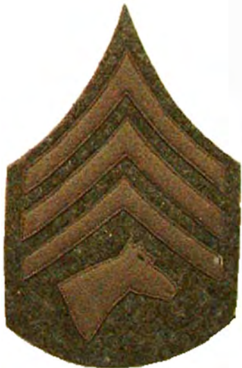
12. STABLE SERGEANT.