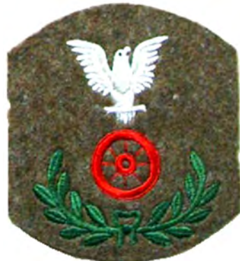
52. MASTER ENGINEER JUNIOR GRADE CORPS OF ENGINEERS.