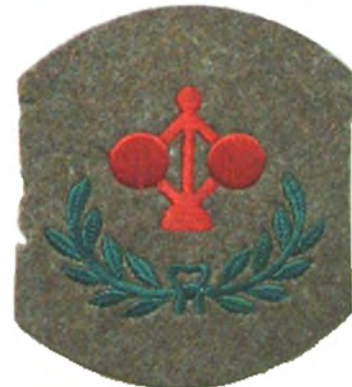
36. ASSISTANT ENGINEER C.A.C. OILER MINE PLANTER SERVICE.