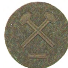
27. CHIEF MECHANIC.