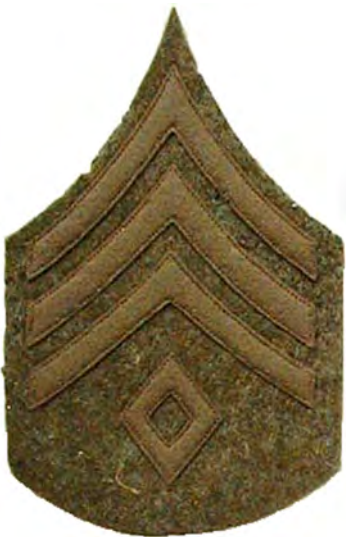
8. FIRST SERGEANT.