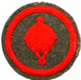
48. CHIEF LOADER C.A.C.