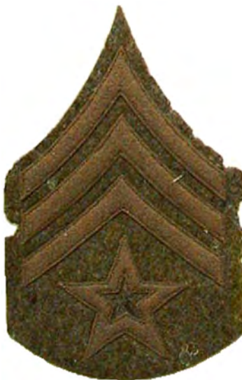
9. COLOR SERGEANT.