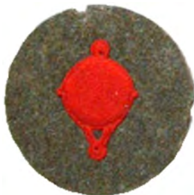
70. SECOND CLASS GUNNER MINE CO. C.A.C.