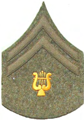
19. BAND CORPORAL.