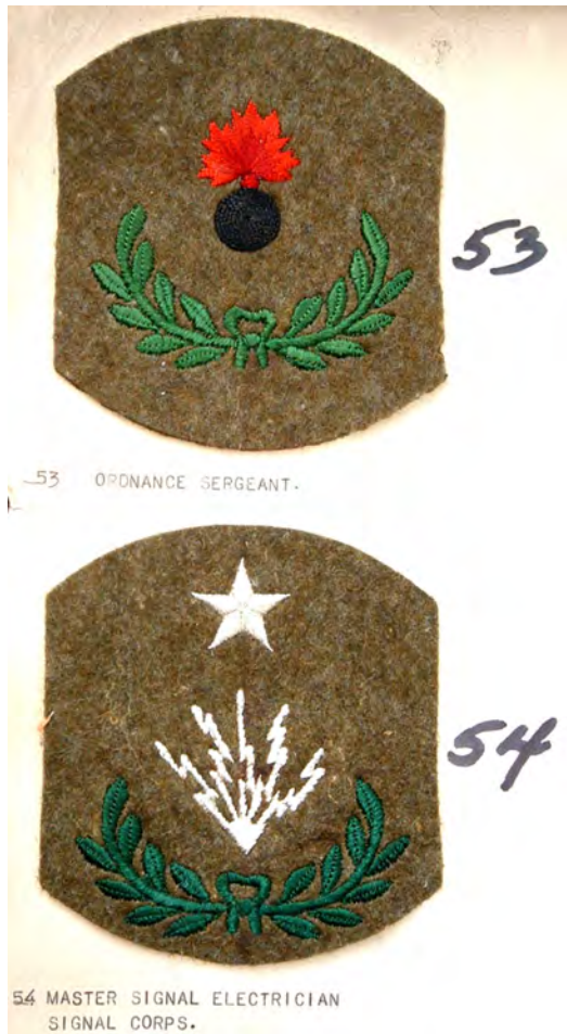
FIG 2. Closeup of chevrons 53 and 54.

In creating the samples book the Quartermaster Corps included some chevrons more than once, demonstrating the identical pattern being authorized for a particular specialty unit type across different branches. The first of the duplicate chevrons displays a white star above five white sparks and a green wreath, this design appearing for: #34, master electrician, Coast Artillery Corps; #54, master signal electrician, Signal Corps; and #62, master signal electrician, Air Service. The second duplicated pattern displays a white star and eagle above a red wheel within a green wreath, and appears for #51, master engineer senior grade, Corps of Engineers; #61, master engineer senior grade, Tank Corps; and #63, master engineer senior grade, Transportation Corps. A similar set, but consisting of only two chevrons, #52, master engineer junior grade, Corps of Engineers, and #64, master engineer junior grade, Transportation Corps was issued. The Tank Corps was not authorized a master engineer junior grade. The remaining two duplicate pairs of chevrons display crossed keys and sword for the Quartermaster Corps. Those with stars are #57 for quartermaster sergeants senior grade, Quartermaster Corps and #65 for the Motor Transport Corps. Identically patterned chevrons, minus the star are presented as #58, for