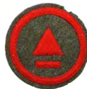
43. OBSERVER FIRST CLASS C.A.C.