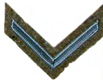
75. WAR SERVICE.