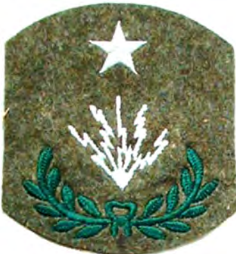
54. MASTER SIGNAL ELECTRICIAN SIGNAL CORPS.