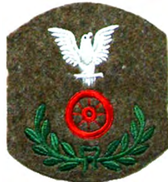
51. MASTER ENGINEER SENIOR GRADE CORPS OF ENGINEERS.