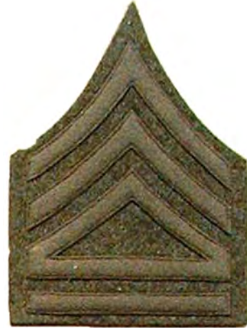
4. BATTALION AND SQUADRON SUPPLY SERGEANT.