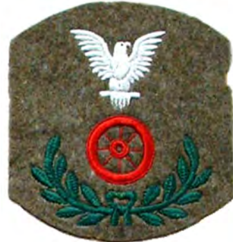
64. MASTER ENGINEER JUNIOR GRADE TRANSPORTATION CORPS.