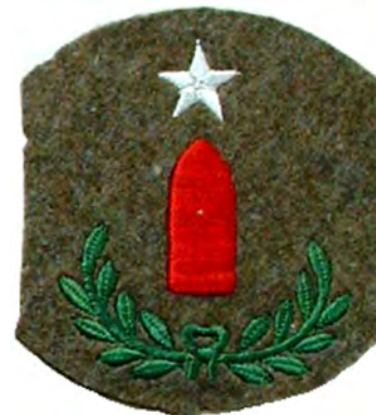
41. MASTER GUNNER C.A.C.