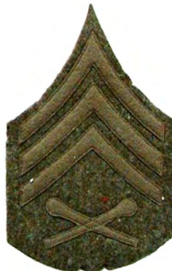
59. DRUM MAJOR.