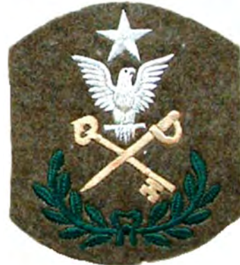
65. QUARTERMASTER SERGEANT SR. GR. MOTOR TRANSPORT CORPS.