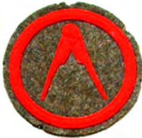
45. PLOTTER C.A.C.