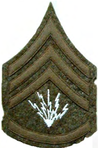
38. ELECTRICAL SERGEANT SECOND CLASS C.A.C.