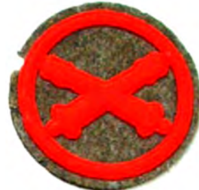
50. GUN POINTER C.A.C.