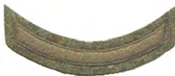
21. PRIVATE FIRST CLASS ALL ARMS AND DECKHAND MINE PLANTER SERVICE.