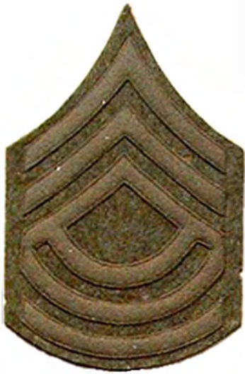
1. REGIMENTAL SERGEANT MAJOR AND SERGEANT MAJOR SENIOR GRADE.