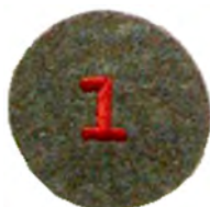
71. BADGE FOR EXCELLENCE IN COAST ARTILLERY PRACTICE.