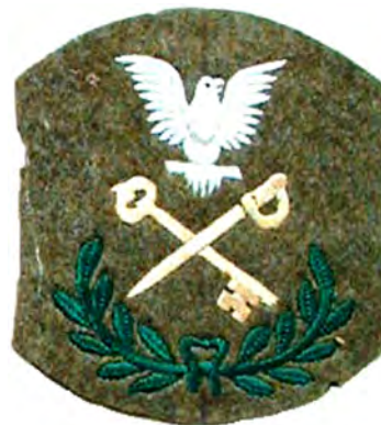
58. QUARTERMASTER SERGEANT JR. GR. QUARTERMASTER CORPS.