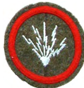
42. CASEMATE ELECTRICIAN C.A.C.