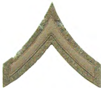
20. LANCE CORPORAL.