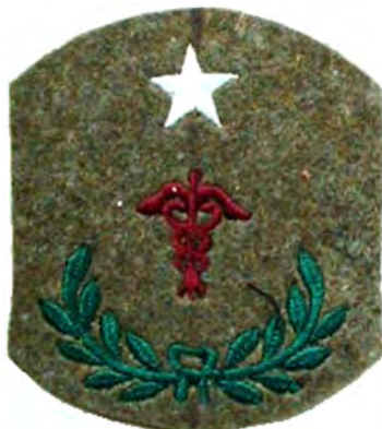
55. MASTER HOSPITAL SERGEANT.