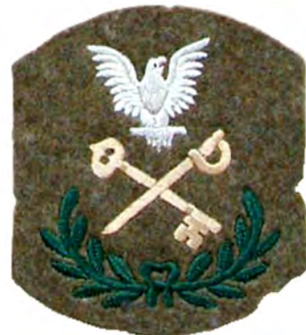
66. QUARTERMASTER SERGEANT JR. GR. MOTOR TRANSPORT CORPS.